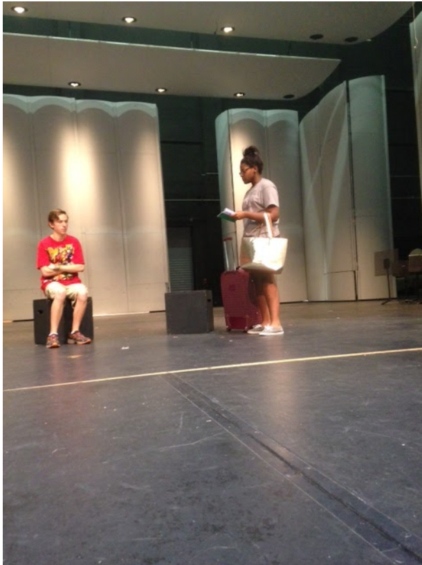
We added a few boxes to serve as outdoor furniture that we're getting later