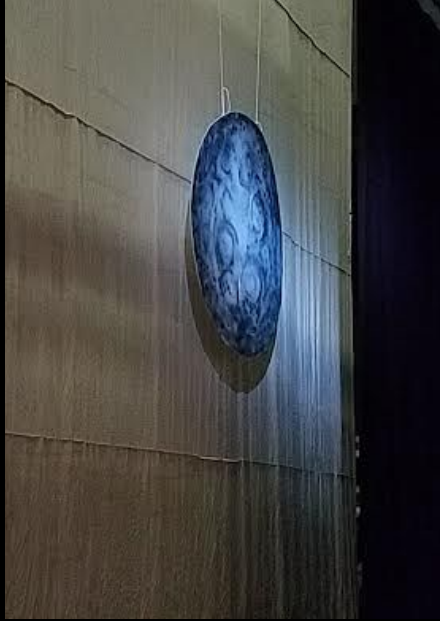
Blue light for moon.

Then I began getting specific with my lighting.