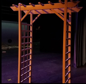
I chose pinks and oranges for Act 2.